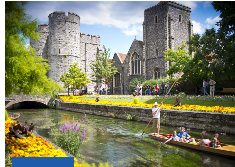
Learn English in the world famous Cathedral City

ADDRESS: NEW DOVER RD, CANTERBURY, UK, CT1 3LQ