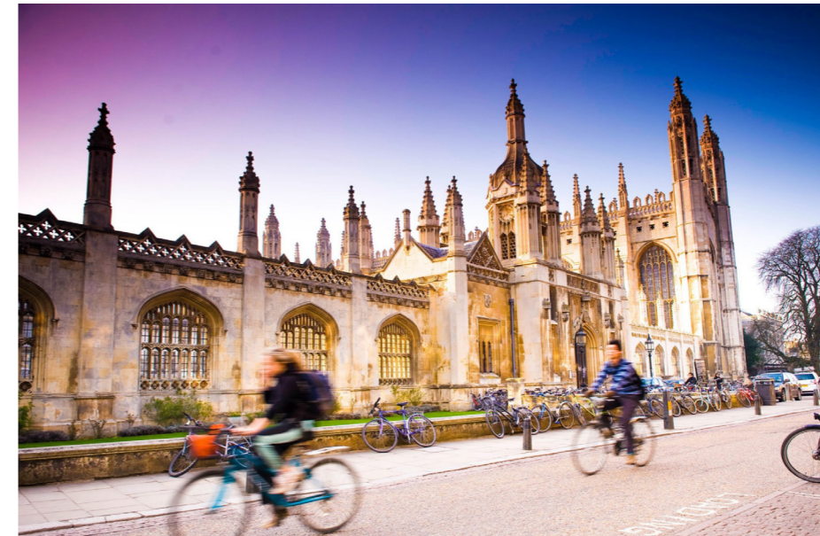
Students can enjoy exploring the vast array of historic sights on offer in the City of Cambridge

ADDRESS: STAFFORD HOUSE INTERNATIONAL, 15 ROUND CHURCH ST, CAMBRIDGE CB5 8AD