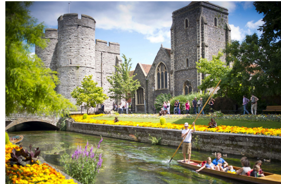
Learn English in the world famous Cathedral City

ADDRESS: STAFFORD HOUSE INTERNATIONAL, 19 NEW DOVER ROAD, CANTERBURY, CT1 3AS