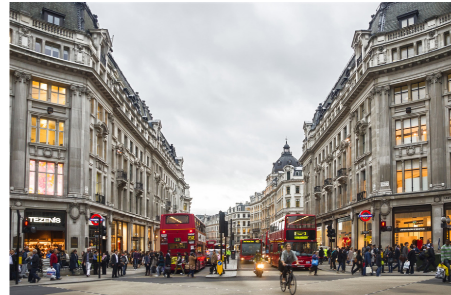
Students can enjoy exploring all that London has to offer, including shopping on Oxford Street (above)

ADDRESS: STAFFORD HOUSE INTERNATIONAL, 43-45 BLOOMSBURY SQUARE, LONDON, WC1A 2RA