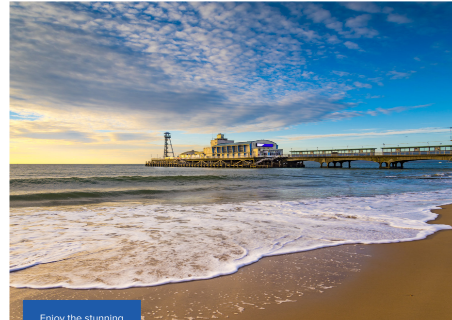
Enjoy the stunning Bournemouth beach just 5 minutes walk from the school

ADDRESS: BOURNEMOUTH COLLEGIATE SCHOOL, COLLEGE ROAD, BOURNEMOUTH, DORSET, BH5 2DY