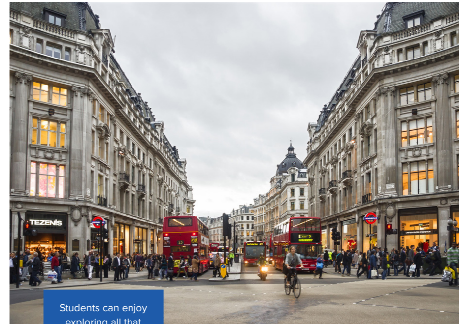
Students can enjoy exploring all that London has to offer, including shopping on Oxford Street (above)

ADDRESS: STAFFORD HOUSE INTERNATIONAL, 43-45 BLOOMSBURY SQUARE, LONDON, WC1A 2RA