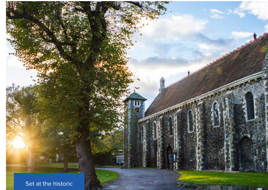
Set at the historic Dover College and less than 15 minutes from the beach. Visit the famous Dover Castle (top right)

ADDRESS: DOVER COLLEGE, EFFINGHAM CRES, DOVER CT17 9RH