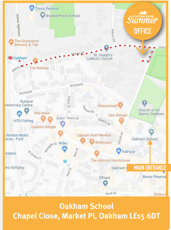
Oakham School Chapel Close, Market Pl, Oakham LE15 6DT

From London, take the M1 and exit at junction 15 towards Northampton. Merge onto the A508 and then onto the A45. At the Lumbertubs Way Interchange, take the A43 to Kettering. After 14km, take the A6003 to Corby and Oakham. The school is situated in the town centre.