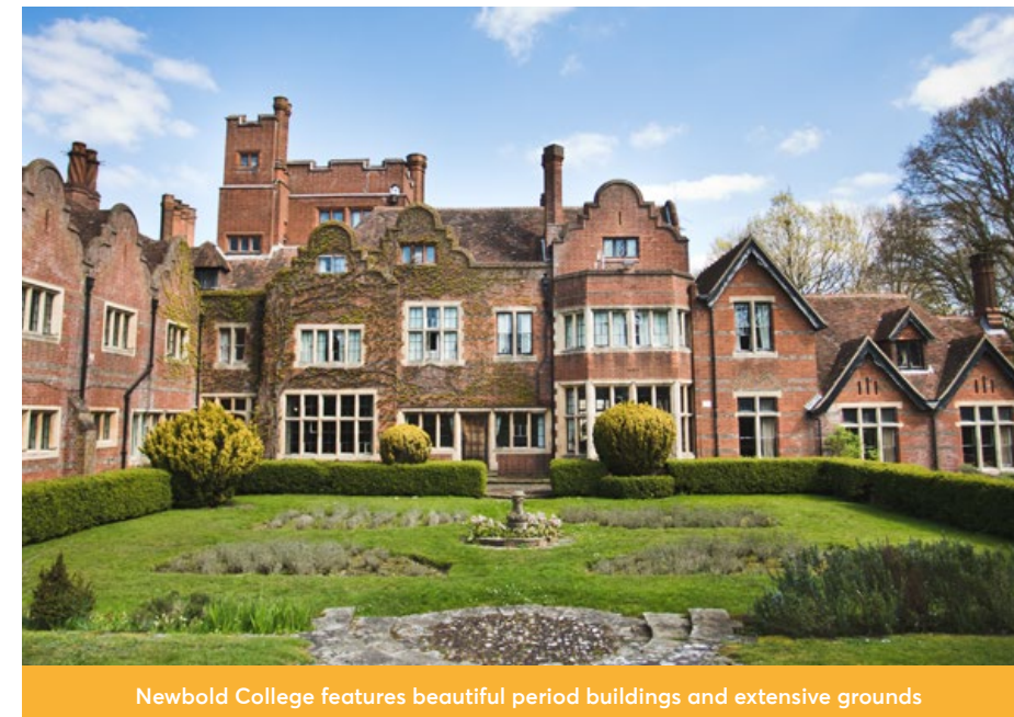
Newbold College features beautiful period buildings and extensive grounds

ADDRESS: NEWBOLD COLLEGE, ST MARK'S ROAD, BINFIELD, BERKSHIRE RG42 4AN