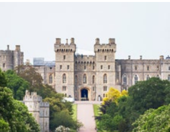
Students will have the chance to visit historic Windsor Castle