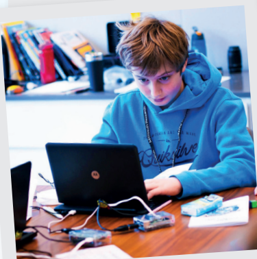
Timetables designed to give balance and variety