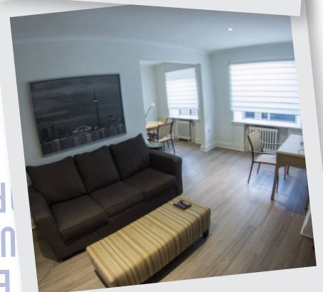
Toronto Residence Student Lounge