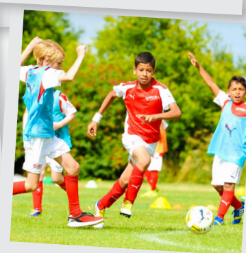
Arsenal soccer school for boys and girls!