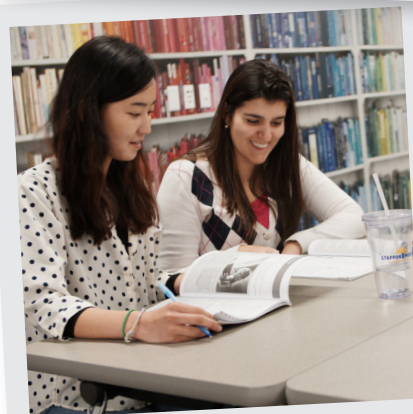
Extra study resources