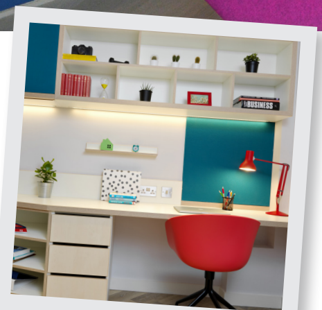
Cambridge Residence Student Desk