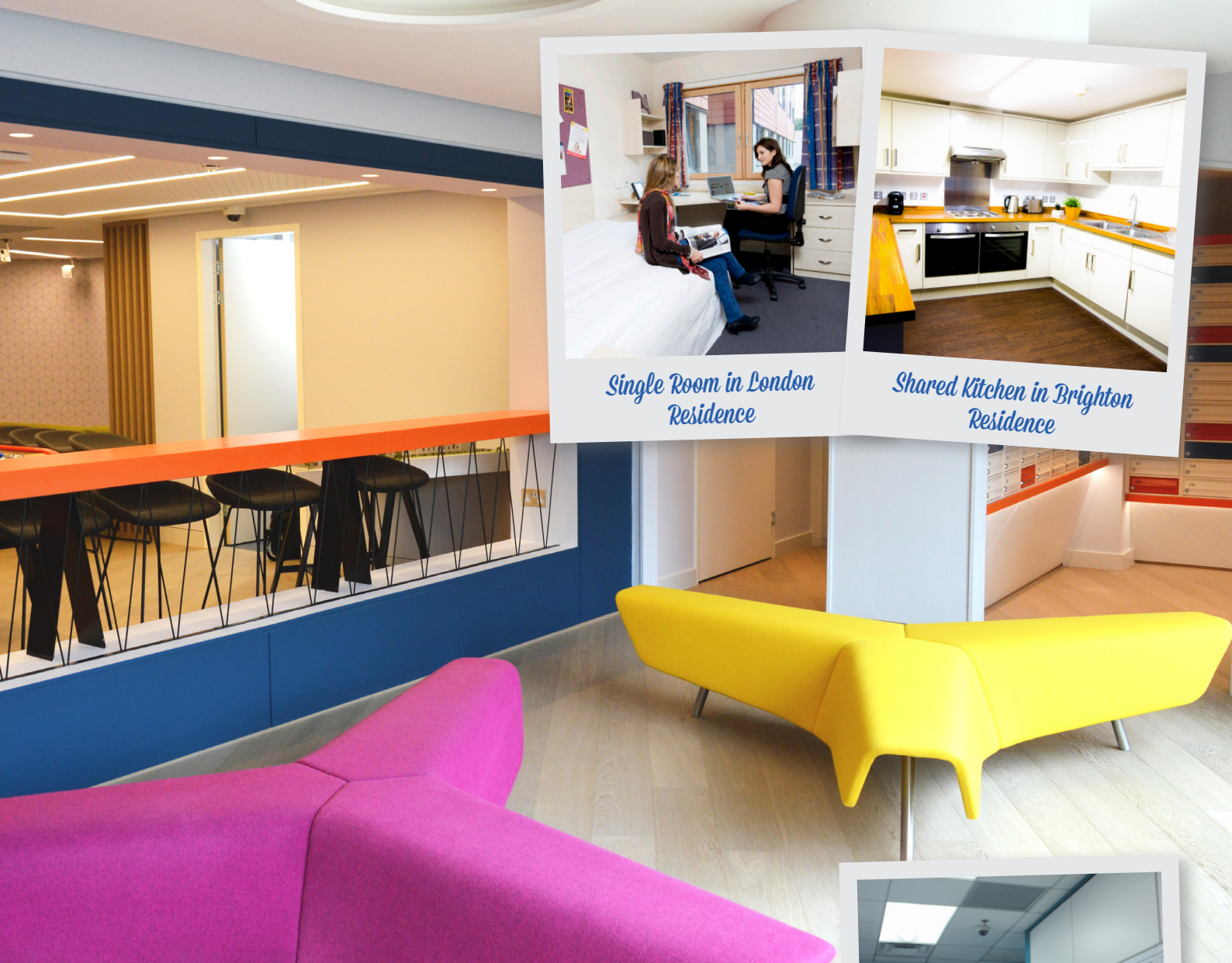
Single Room in London Residence