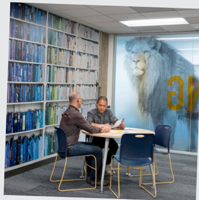
One-on-one teaching at all levels