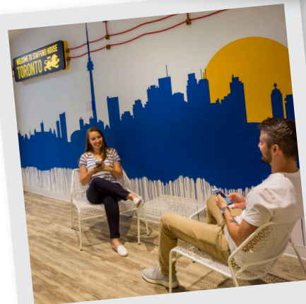
Build your confidence