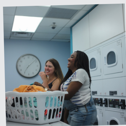
Chicago Residence Laundry

As all of our schools are in popular student cities, there is a wealth of private accommodation to rent, to suit all requirements and budgets. Our staff will be happy to help.