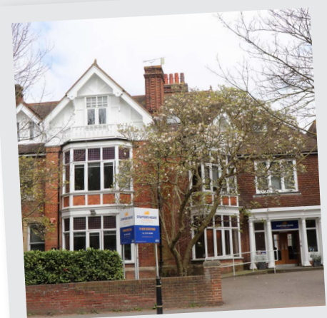
Walking distance from our beautiful school